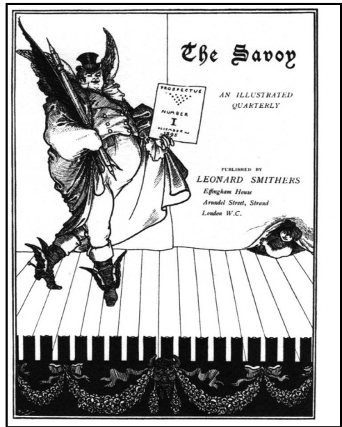
Prospectuses for The Savoy , November 1895 [checklist no. 103a]